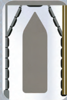
Inside marina berths.

In case of damages on the ParmaFender®, each segment can easily be cut off and replaced with a new segment by means of splice plugs.