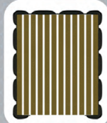
Around floating docks.