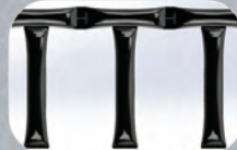
On quay walls.